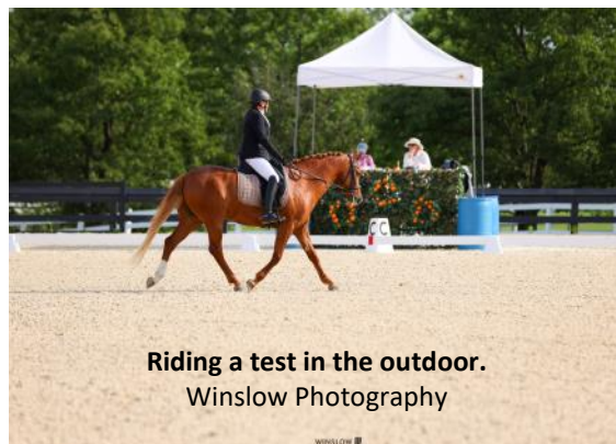
Riding a test in the outdoor.

The judges gave clear and pointed feedback with a positive approach. No white washing here.