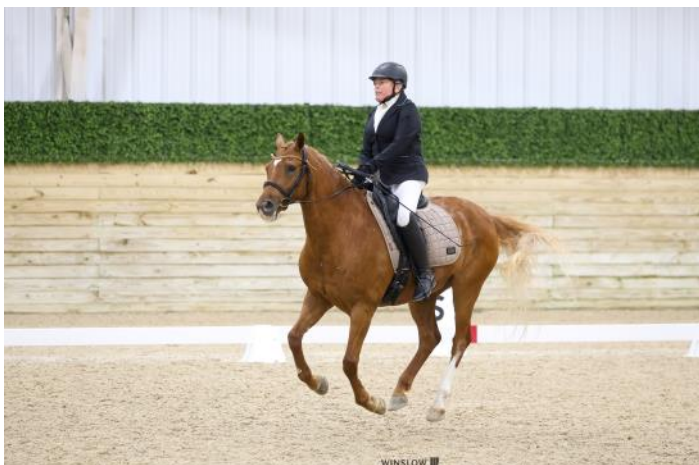
Winslow photography catches the good, the bad, and the unexpected.