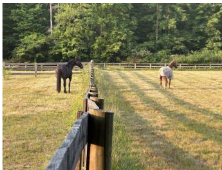
This year's NODA Dressage Adventures and More leased out Brecksville Stables Thursday through Sunday. Our horses enjoyed the turnout.

Without having a horse at the program, and having to stay off my feet when I could, I was able to see more than usual. I watched a friend with a brand new horse develop confidence in herself and her horse and go from an "I am not sure I am going to ride" attitude to rocking it in dressage lessons on the Working Equitation course. I saw a young horse scared of her shadow learn to try new things and actually relax under saddle due to the gentle ways of her rider and the tidbits of information she got from the instructors. I cheered on a friend who got a beautiful uphill canter de-