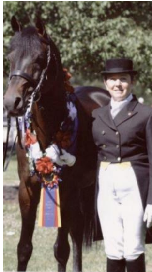
Charma and Allemar+//