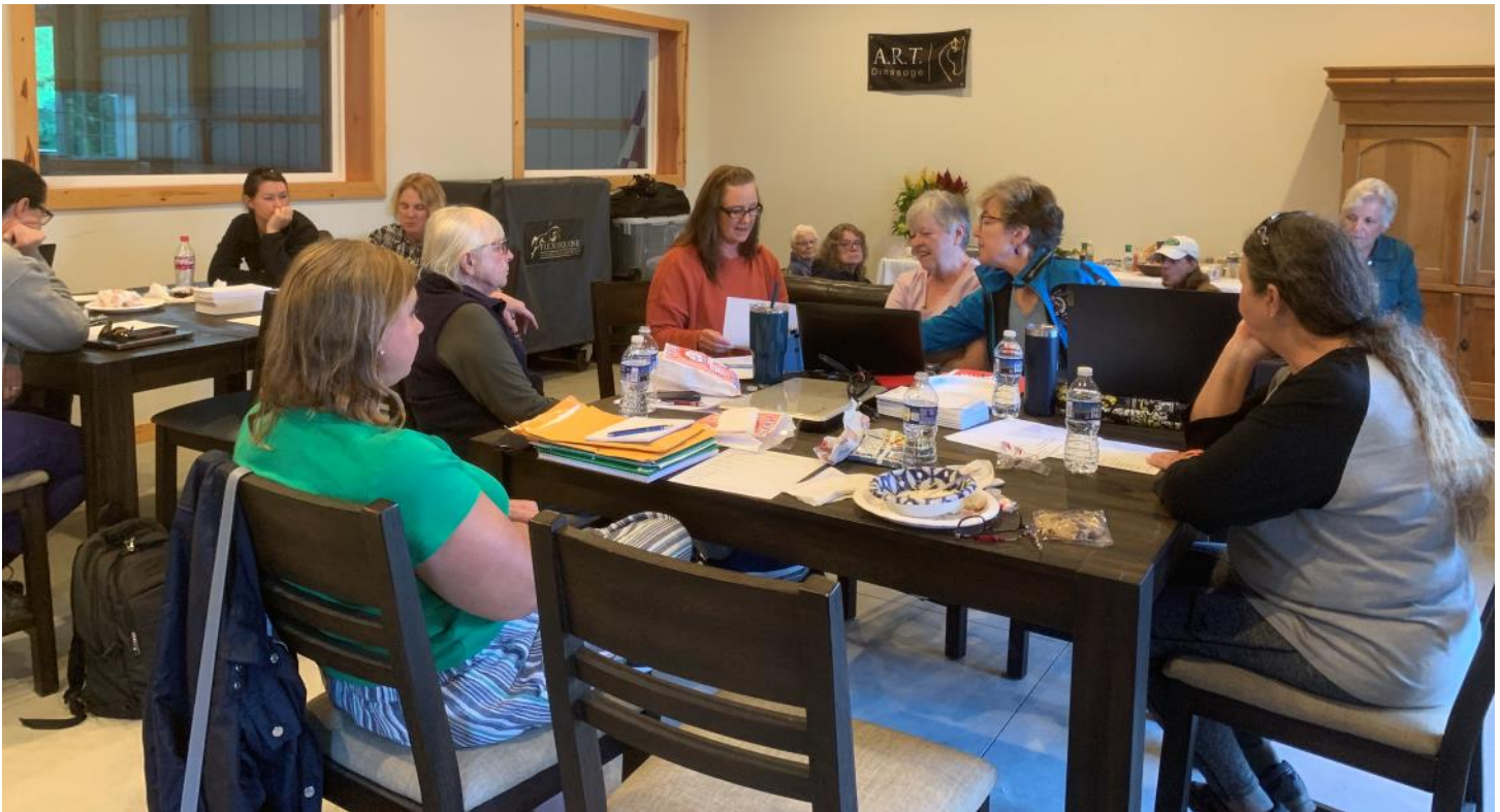
NODA members at the September open board meeting in the viewing room of Endeavor Farm, Hudson, Ohio.

Who Are the STARS Who Get Their Photos and Write-up in the NODA News?