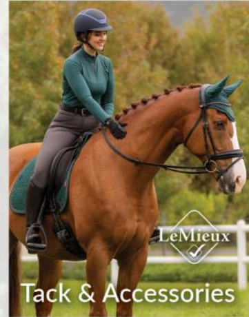
LeMieux Tack & Accessories

Mention this ad for a FREE Gift in-store