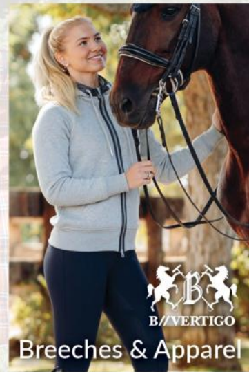
B/VERTIGO Breeches & Apparel

9440 St. Rt. 14 Streetsboro, OH 44241 800-321-2142 www.bigdweb.com