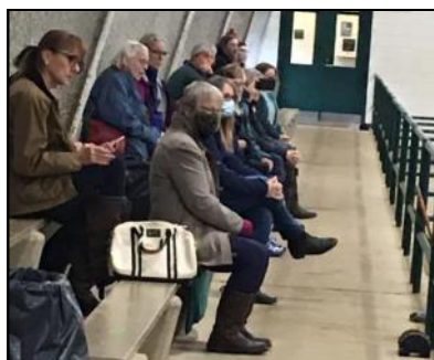
Auditors took away useful exercises and tidbits for riding and training.

Olympic teams (1980, 1988), the World Championships, and the World Cup, her ponies held a special place in her heart.